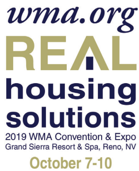
EXHIBIT HALL ACTIVITIES